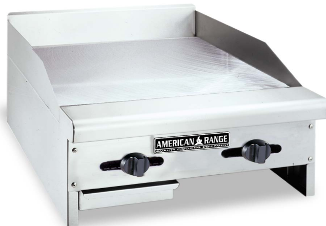
ACCG - 24